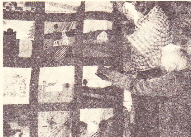
Presentation of quilt by women of New Hurley Church (see article on page 3)