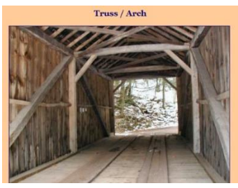
KING POST DESIGN

What's a TRUSS and how they work? Why did the US build bridges of wood instead of stone? Invention of types of trusses from 1804 to 1860.